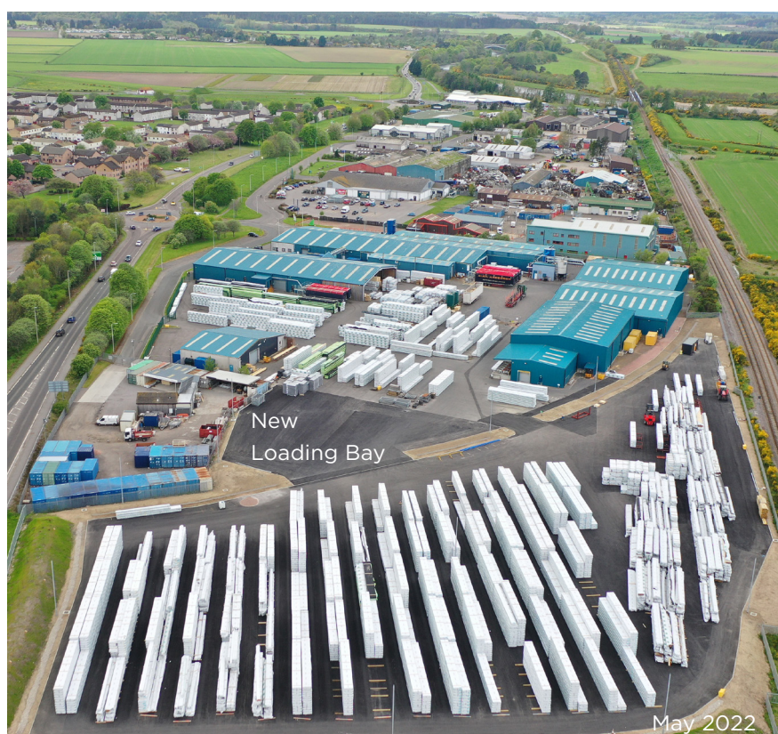
Forres site May 2022

The yard can now hold up to 1M LM of product. The loading bay has been relocated to help with the natural flow of the site. The new location is shown on the image opposite.